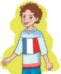
France / French