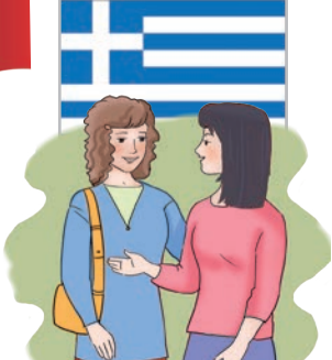
Greece / Greek