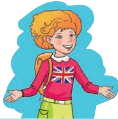
Britain / British