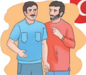
Turkey / Turkish